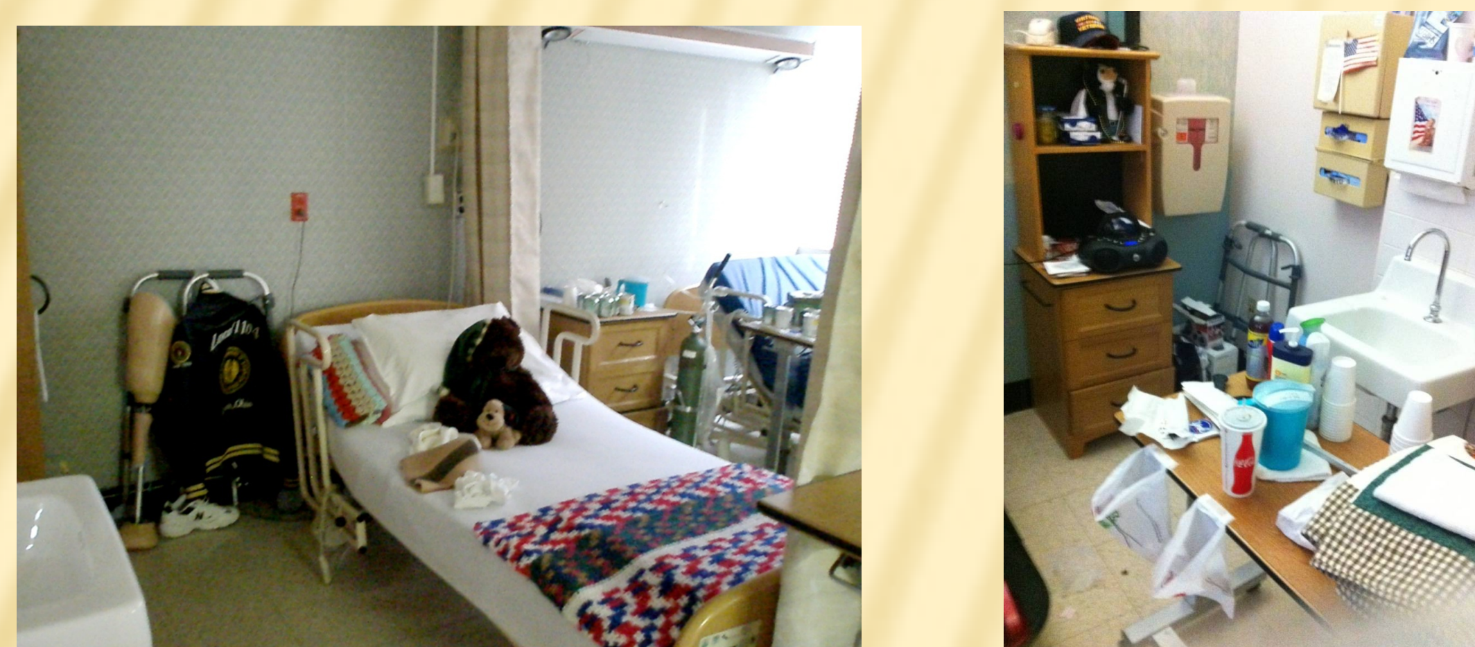
Figure 1. Personal items in long term care facility patient rooms