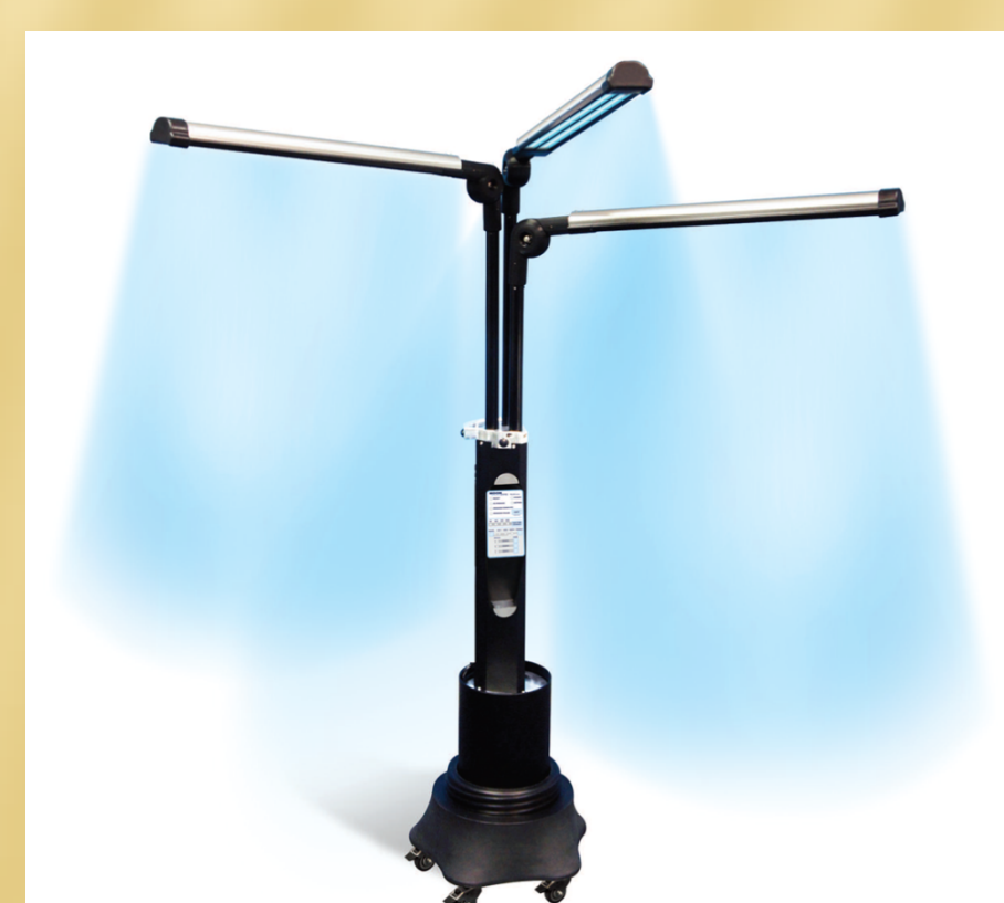
Figure 2. Moonbeam3 UV-C device